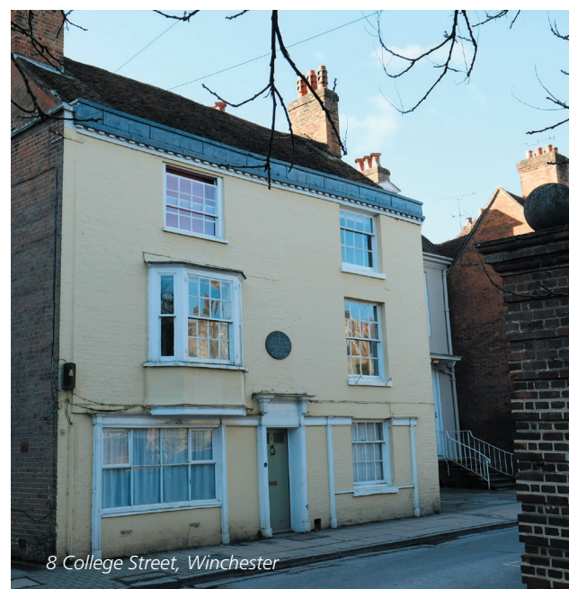
8 College Street, Winchester